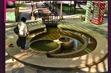
▼ Kolam mata air panas 'jantan' A 'male' hot spring pool