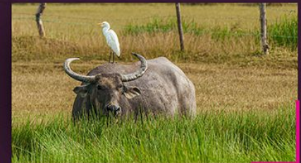
▲ Pemandangan kawasan paya, sawah bendang, kerbau dan burung puchong dari kolam mata air panas Views of swamps, paddy fields, buffaloes and egrets from the hot spring pools