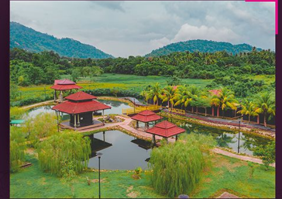
▲ Lanskap kolam mata air panas Landscape of hot spring pool