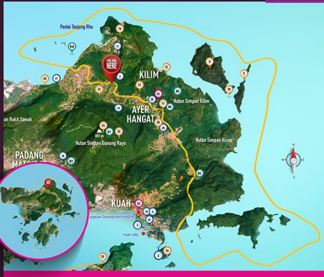
▼ Kompleks rekreasi mata air panas Kampung Ayer Hangat Hot spring recreation of Ayer Hangat Village complex