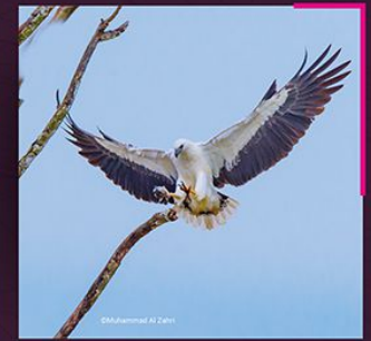
Puncak pinakel ialah tempat hinggap kegemaran Lang siput ini The pinnacle is a favourite perching site of this White-bellied sea eagle