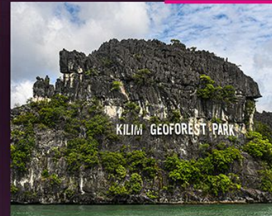
Puncak pinakel berbentuk seperti kura-kura Peaks of the pinnacle that look like a tortoise