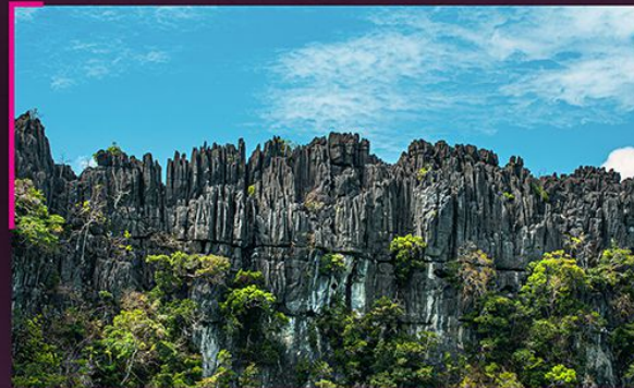
Pinakel Kilim Kilim pinnacle