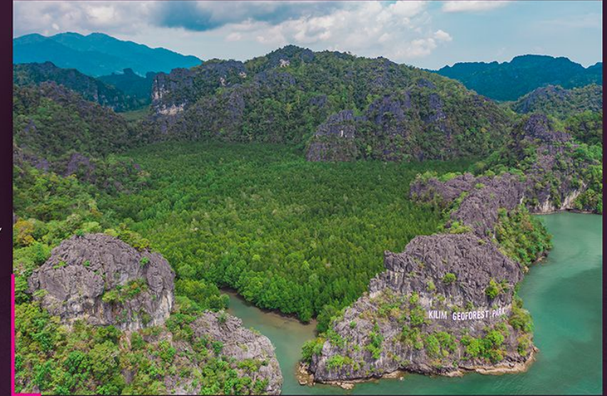
Dolina di belakang pinakel dilitupi hutan bakau asli A dolina behind the pinnacle is covered by pristine mangrove forest

The pinnacle is also a vertical wall of a dolina formed behind it and is now covered by pristine mangrove forest. Shrubs, such as Paraboea lanata , and trees, such as Cycad tree ( Cycas clivicola ) on the vertical wall look like the Hanging Garden of Babylon. Sungai Kilim is the main gateway for fishermen to catch fish in the Andaman Sea. Today, many fishermen have diversified their sources of income through their involvement in operating the Kilim Karst Geotrail tour package.