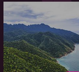
Landskap perbukitan menunjukkan sayap barat antiklin Machinchang miring ke arah laut Hilly landscape of the western slopes of Machinchang antcline plunging into the sea