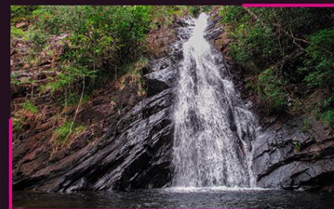
Air terjun Sungai Tama Sungai Tama waterfall